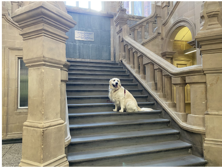
Cover Photo: "The General Offices Stairway"

The General Offices were officially opened by Her Majesty Queen Elizabeth II and His Royal Highness The Duke of Edinburgh during the Diamond Jubilee Tour of Wales in 2012.